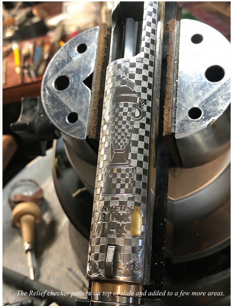
The Relief checker pattern on top of slide and added to a few more areas.

I started this project with a Colt MK IV Series