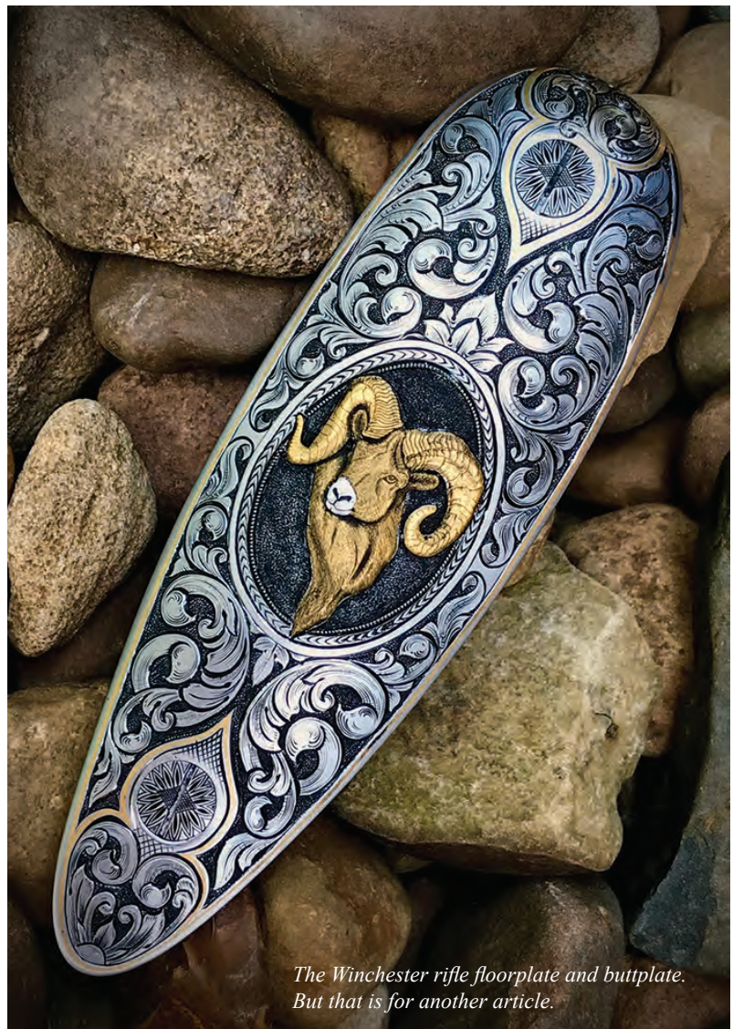
The Winchester rifle floorplate and buttplate. But that is for another article.